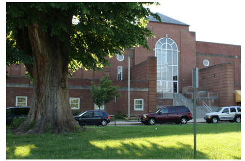
Frederick High School has a failing fire alarm system. There is but one single door opening to the outside from the lunchroom.

Economic conditions and budget cutbacks have forced even the most desperately needed renovations to the back burner. Any increase in residential growth will only add to the pressures and, at the same time, reduce the funds available, per capita, to fix our older schools.