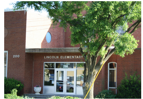
Lincoln Elementary School, 88 years old, will cost over $30 million to replace. LES is but one of 40 schools that are over 25 years old.